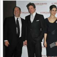
A Mistake to Write Off the Weinsteins