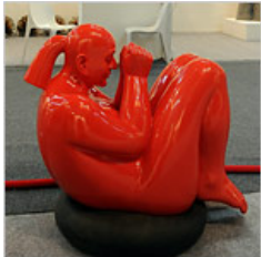
In India, a Busy Fair and a Spirited Art Scene