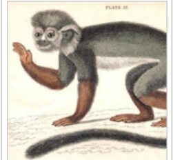
Specimens: Nature and Nonsense

Home | World | U.S. | N.Y. / Region | Business | Technology | Science | Health | Sports | Opinion | Arts | Style | Travel | Jobs | Real Estate | Autos | Back to Top