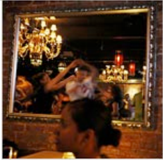
So You Think You Can't Salsa?