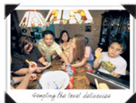
Sampling the great outdoors