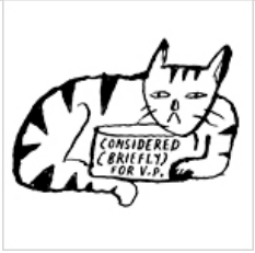
Op-Ed: My Convention Memory

Home | World | U.S. | N.Y. / Region | Business | Technology | Science | Health | Sports | Opinion | Arts | Style | Travel | Jobs | Real Estate | Automobiles | Back to Top