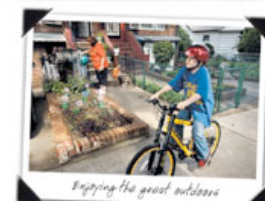
Enjoying the great outdoors