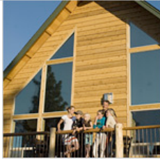
Off the Grid and Powering Up