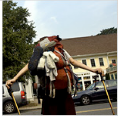
In Connecticut, Upper Crust Meets Unwashed