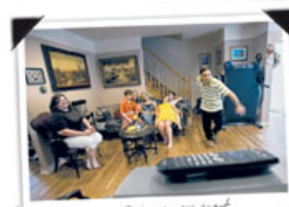
Relaxing on a bench

"I played dominoes," he recalled. "Nothing crazy. Go to the movies. Yankee Stadium, City Island. Just stay local, basically."