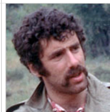
An Angsty Actor Who Embodied His Times