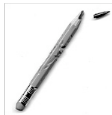
Letters: Priority No. 1, Educate Our Kids