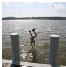
The Hudson's New Wave

Freakonomics: How Domestic Violence Affects Everyone's Kids