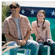
Hey, America, This Guy's for You

Freakonomics: How Domestic Violence Affects Everyone's Kids