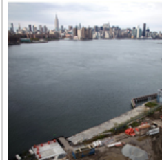
New York's Next Frontier: The Waterfront