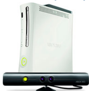
The Kinect controller for the Xbox 360, with lenses in the base that track a player's movements.

The Kinect ("kinetic" plus "connect," get it?) is an add-on for the existing Xbox 360. If you already have an Xbox, you can buy the Kinect for $150, or you can buy it with a four-gigabyte Xbox for $300 — if you can find it in stock.