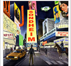
Hearing With the Heart

Home | World | U.S. | N.Y. / Region | Business | Technology | Science | Health | Sports | Opinion | Arts | Style | Travel | Jobs | Real Estate | Autos | Back to Top