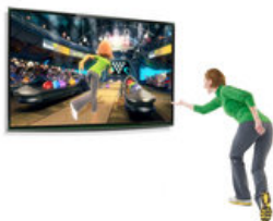
The bowling game from the Kinect Sports collection, which also features unseen commentators.

The point is to let you control games with your body, without having to find, hold, learn or recharge a controller. Your digital stunt double appears on the TV screen. What you do, it does.