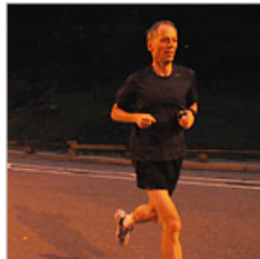
Running for Your Life