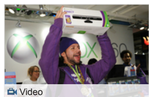
Microsoft Advances Gaming