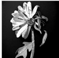
Letters: Facing the Scourge of Alzheimer's