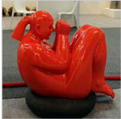
In India, a Busy Fair and a Spirited Art Scene