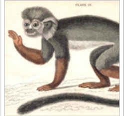
Specimens: Nature and Nonsense

Home | World | U.S. | N.Y. / Region | Business | Technology | Science | Health | Sports | Opinion | Arts | Style | Travel | Jobs | Real Estate | Autos | Back to Top