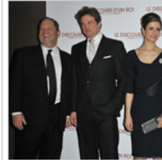
A Mistake to Write Off the Weinsteins