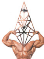
The Ripped and the Righteous