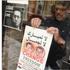
Meeting in Little Egypt, With Anger and Hope