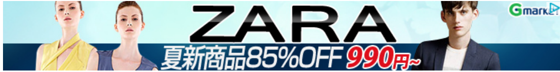
Advertise on NYTimes.com