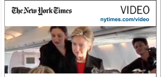
A look back at the Clinton campaign