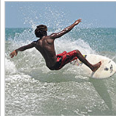
With the Surfers on Costa Rica’s Untamed Coast