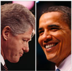
Is Obama Fulfilling Clinton’s Promise?