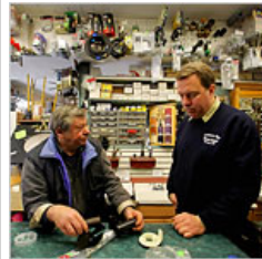
Mom and Pop, Just Scraping By