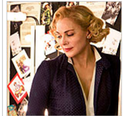
The East Side Siren Conquers the West End