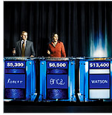
What Is I.B.M.'s Watson?