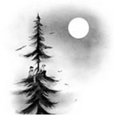
Op-Ed: Generations in the Balance