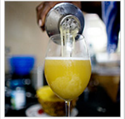
A Liberian Tour With Fork (and Fingers)

Home | World | U.S. | N.Y. / Region | Business | Technology | Science | Health | Sports | Opinion | Arts | Style | Travel | Jobs | Real Estate | Autos | Back to Top