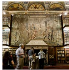
It Was a Royal Pain, but It Ended Well