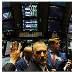
Room for Debate: Wall Street, a Year From Now