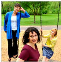
The Gift of Sperm Donor 8282