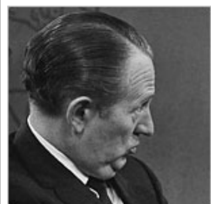
Dick Cavett: Art Did the Darndest Things . . .