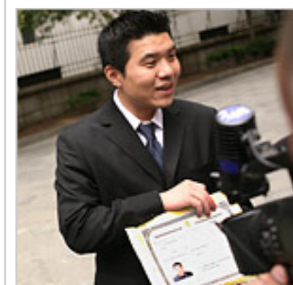
A Pardoned Immigrant becomes a Citizen