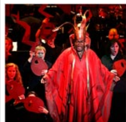
Merely the End of the World