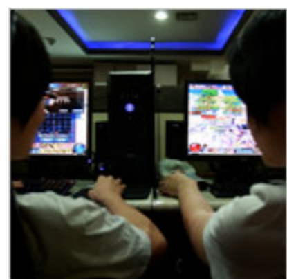
South Korea's Aid for Internet Addiction