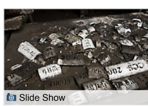
Closing a Historic Steel Mill