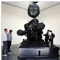
36 Hours in Santa Monica, Calif.