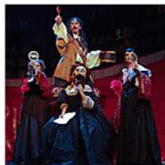
Making Chaos Rhyme With Class, Er, Gas