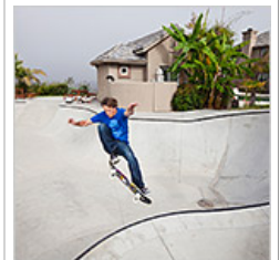
Slide Show: Favorite Spaces