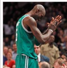
N.B.A. Cracks Down on Whining About Foul Calls