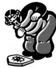
Op-Ed: Accountability Behind the Plate