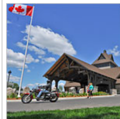
Dressed Up and Ready, Canada Town Is Stood Up

Home | World | U.S. | N.Y. / Region | Business | Technology | Science | Health | Sports | Opinion | Arts | Style | Travel | Jobs | Real Estate | Autos | Back to Top