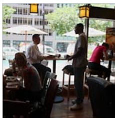
Coffee with Lobbyists