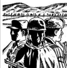
Op-Ed: The Forgotten War, Remembered