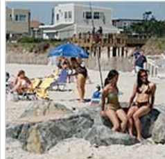
Setting Off a Tsunami: Did It Happen Here?