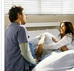
'Scrubs,' Near Death, Is Given a Miracle Cure

Home | World | U.S. | N.Y. / Region | Business | Technology | Science | Health | Sports | Opinion | Arts | Style | Travel | Jobs | Real Estate | Automobiles Back to Top