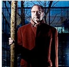
Leaving Platform That Elevated AIDS Fight