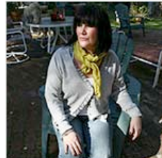
Patient's DNA May Be Signal to Tailor Drugs