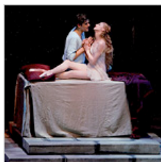
Review: Peter Martins's 'Romeo and Juliet'