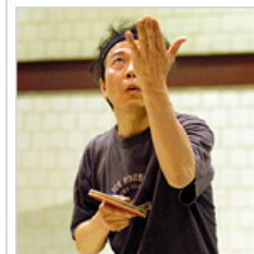
Applebome: A Paddle Community