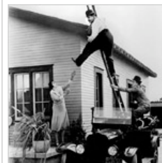
Mr. Fix-It, Watch Out for That Nail Gun