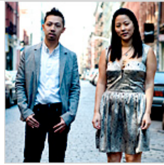
Be a Fashion Insider or Just Look Like One