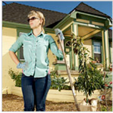
Backyards, Beware: An Orchard Wants Your Spot