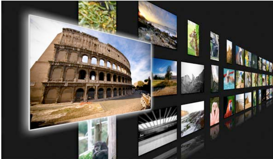
The PicLens software from Cooliris offers a way to directly explore online images without navigating Web pages.

By JOHN MARKOFF Published: March 9, 2008