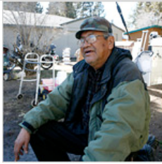
Drawing Lots for Health Care