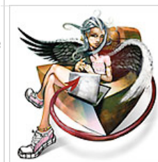
Sorry, Boys, This Is Our Domain

Home | World | U.S. | N.Y. / Region | Business | Technology | Science | Health | Sports | Opinion | Arts | Style | Travel | Jobs | Real Estate | Automobiles Back to Top