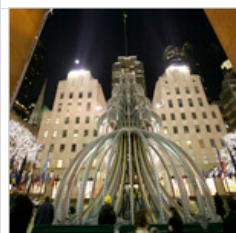
3 Coins Might Short Out This Fountain