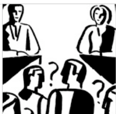
Op-Ed: Questions for Tonight's Debate