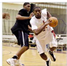
Mean Streets, Best Intentions