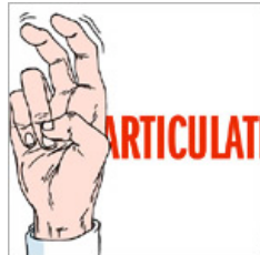
The Racial Politics of Speaking Well