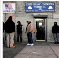
This Hammer for Hire