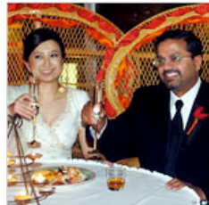
Weddings & Celebrations