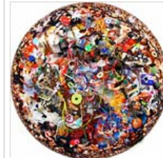
You've Seen the E-Mail, Now Buy the Art

Home | World | U.S. | N.Y. / Region | Business | Technology | Science | Health | Sports | Opinion | Arts | Style | Travel | Jobs | Real Estate | Automobiles | Back to Top