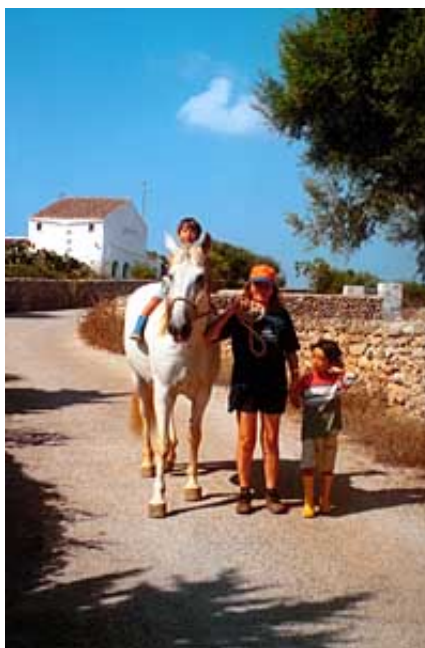
The boys with a friend and her horse outside home

In Menorca this year, spring was lovely, with wild flowers blooming everywhere after a damp and cold winter season. In March, when the almond trees flower, it looks very much like cherry blossom, then after that all the wild flowers start to bloom in one breath and the whole island is covered by their colors and scents. Despite our location, which is very handy for the airport, the atmosphere around our traditional old house is so rural. From the bedroom window right now, we can see a flock of sheep in a field, and tortoises taking a walk after their winter sleep. Here is like Mutsugoro